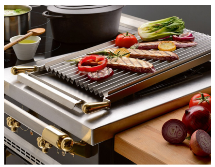
Shown with current stainless steel grease tray and v-groove rack

Flame Grill must be used under a high-capacity exhaust hood system. It essentially brings your outdoor grill indoors. Generates controlled heat without food juices dripping onto the heating elements, resulting in a healthier style of cooking. Cook quickly using radiant heat for meats, fish, or seafood to retain flavors. Operates just like a surface burner for igniting and temp control.