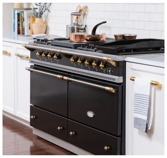
Range: Matte Black Sully, NY Showroom