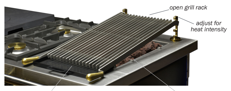
grease tray now stainless steel